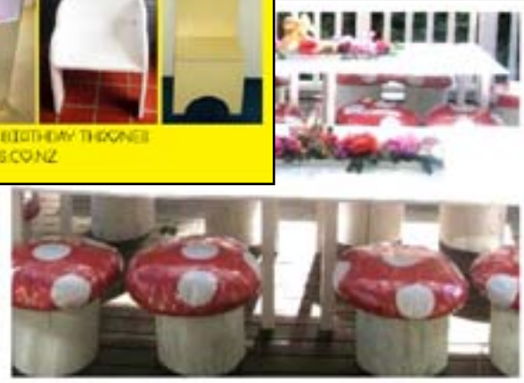
Red Fairy Party