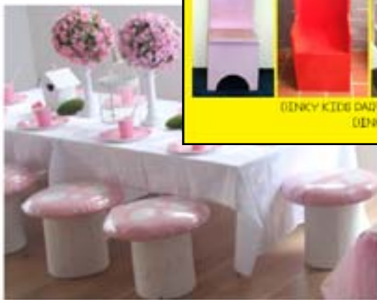
Pink Fairy Party