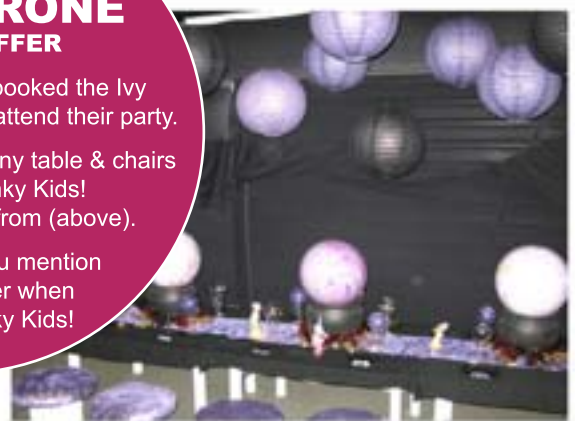
Wizards & Witches Party

For more cool party themes and settings visit our website at: